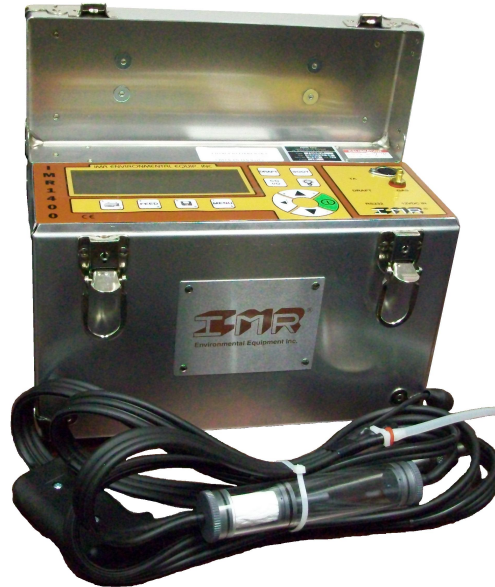
IMR 1400-c - compact (NO)